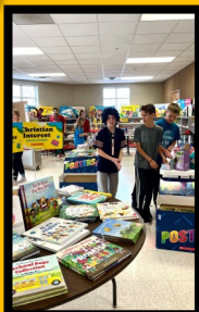
...and the Book Fair!