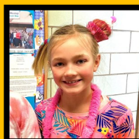
What? A Cupcake in your hair?